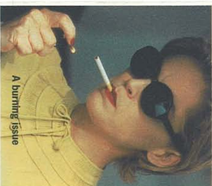
A burning issue

Want to try instead? It's being test-marketed in just six cities, so dial (800) INSTEAD for a discount coupon worth $2 and directions for purchase by mail.