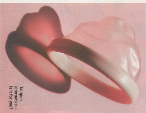
Tampon alternative— is it for you?